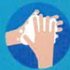
SCRUB: 20 SECONDS